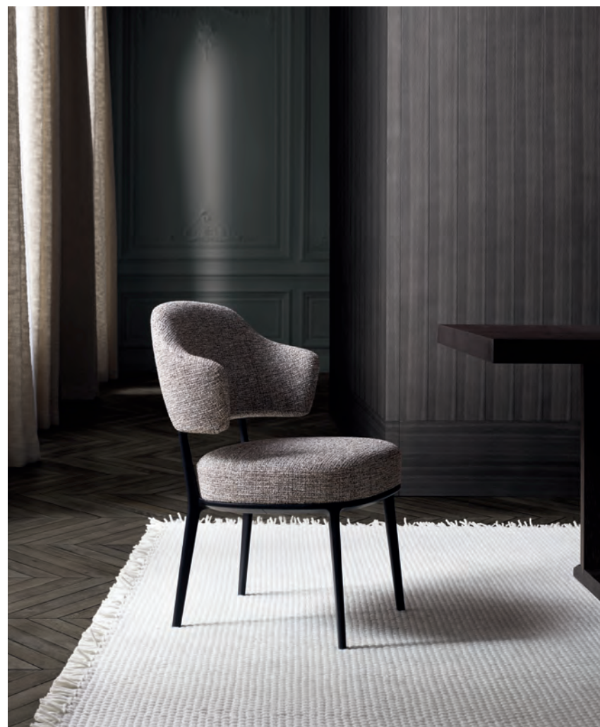
CARATOS CHAIR, DALLAS FABRIC. INTOTO TABLE, NATURAL WENGE. RISO CARPET, LIGHT COLOUR.