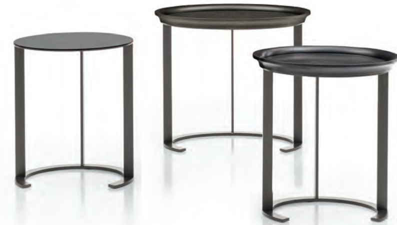
ELIOS SMALL TABLES, TRAY IN BLACK OAK AND SHELLAC TYPE FINISH BLACK AND BLACK BACK-PAINTED SMOKY GLASS.