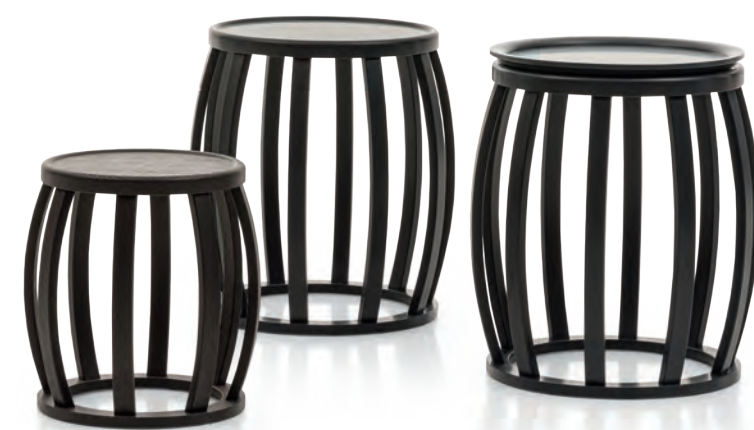
LOTO SMALL TABLES, BRUSHED BLACK OAK AND SHELLAC TYPE FINISH BLACK.