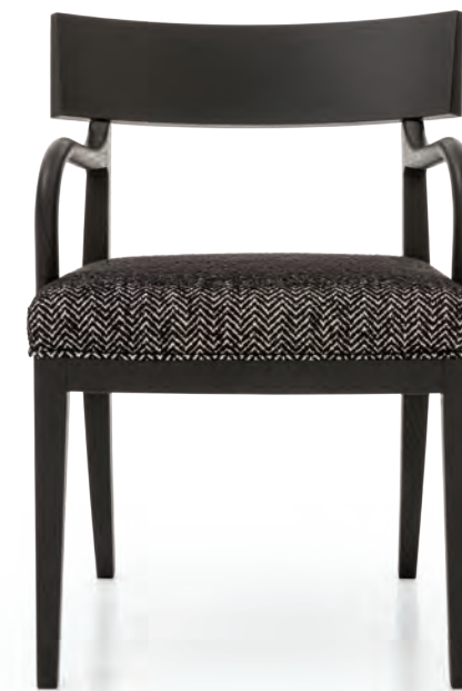
DESPINA CHAIRS, LOSANNA FABRIC BRUSHED BLACK OAK. PRIVATUS WINDSCREEN, LIGHT COLOUR RAFFIA. INTOTO TABLE, NATURAL WENGE. MILOS CARPET, QUARTZ COLOUR.