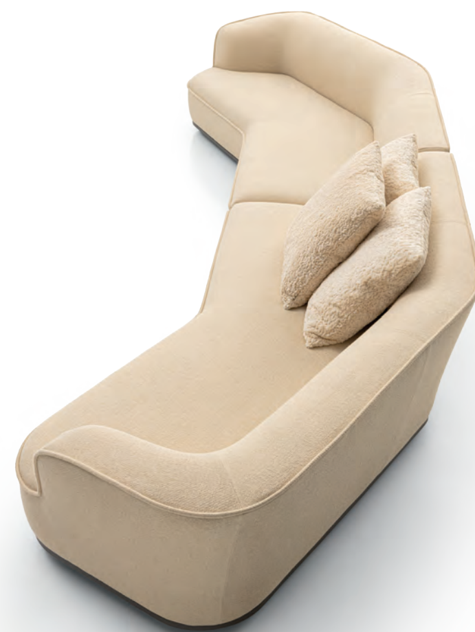
LILUM SOFA, LONDRA FABRIC.