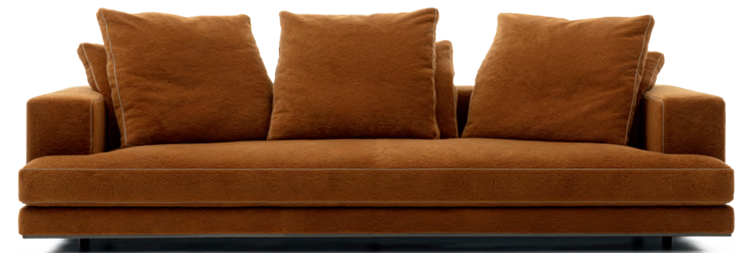
ARBITER SOFA, MILO FABRIC.