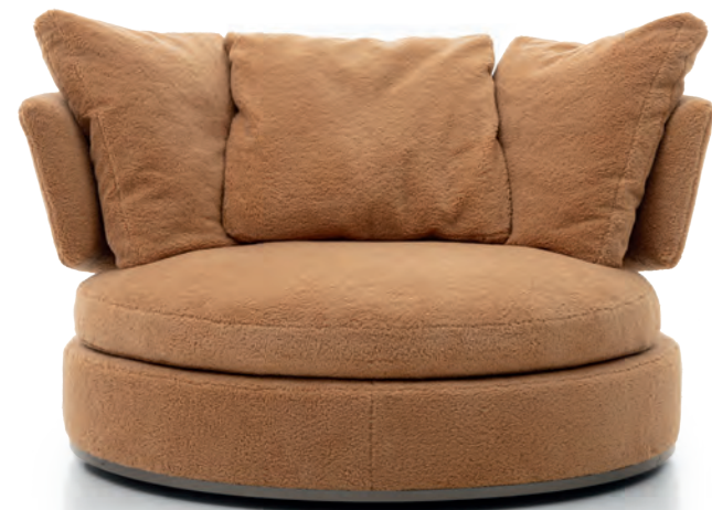
AMOENUS SOFT SWIVEL SOFA, MILO FABRIC.