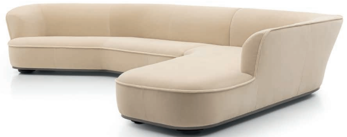
LILUM SOFA, LONDRA FABRIC.