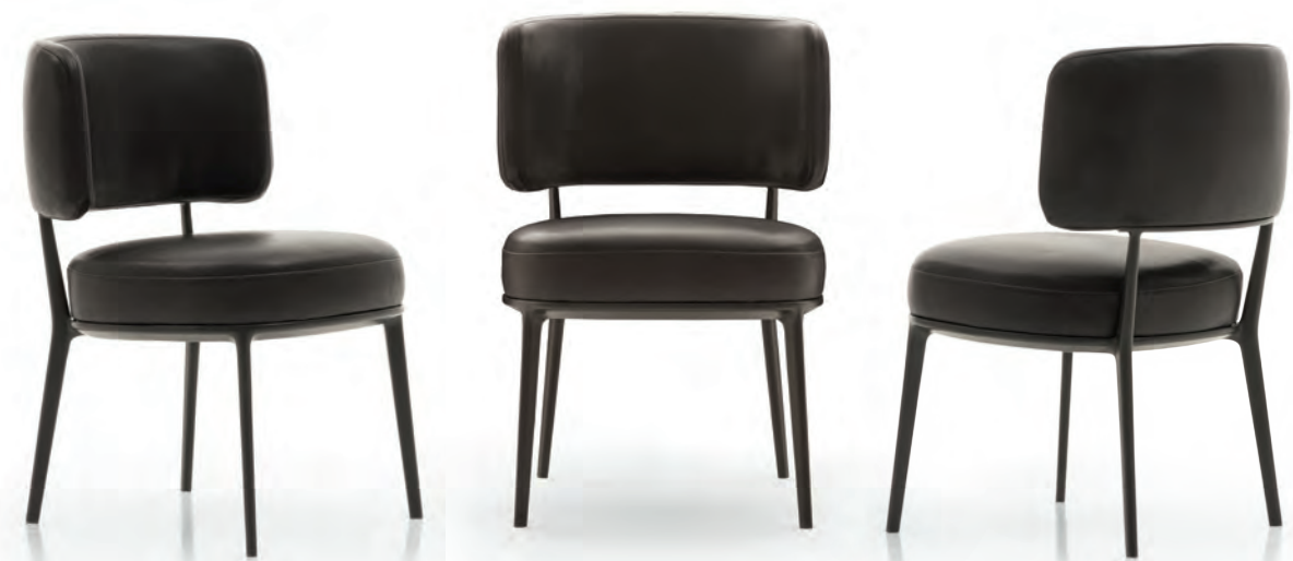
CARATOS CHAIRS, BLACK KASIA LEATHER.